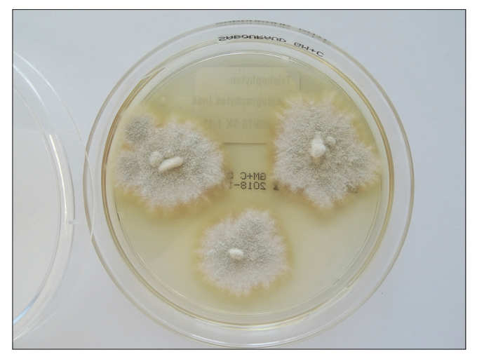
Figure 1a: Flat, white, slightly yellowish, fast growing and expanding granular colonies with hyphae bundles in the periphery and with slight yellowish-to-beige pigmentation in the centre are typical for Trichophyton mentagrophytes of the Indian genotype VIII. One-week old colonies on Sabouraud's dextrose agar