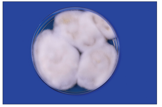
Figure 1c: White and slightly yellowish fluffy fast growing colonies of Trichophyton mentagrophytes VIII India